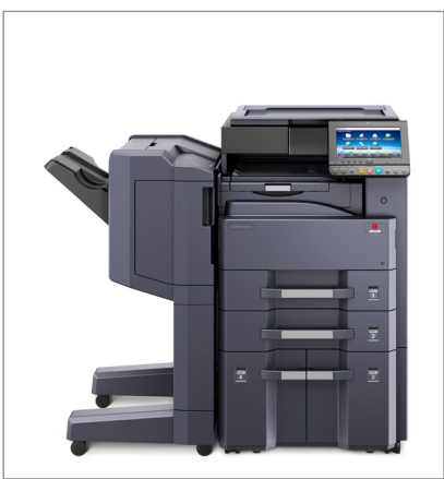
d-Copia 3201MF (or d-Copia 4001MF) + Platen Cover (E) + PF-810 + DF-7120 + AK-740