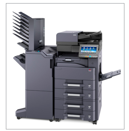
d-Copia 3201MF (or d-Copia 4001MF) + DP-7110 + PF-791 + DF-7110 + AK-740 + MT-730(B)